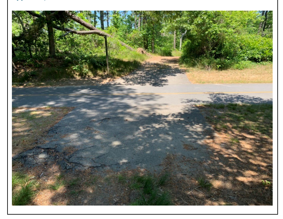
Figure 156: View of Trail Crossing at Uncle Harry's Road (Taken from Road Approach)